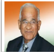
Shri. Rohidas Patil Ex-Minister of Agriculture [Maharashtra Govt] Hon'ble Patron, Jawahar Medical Foundation