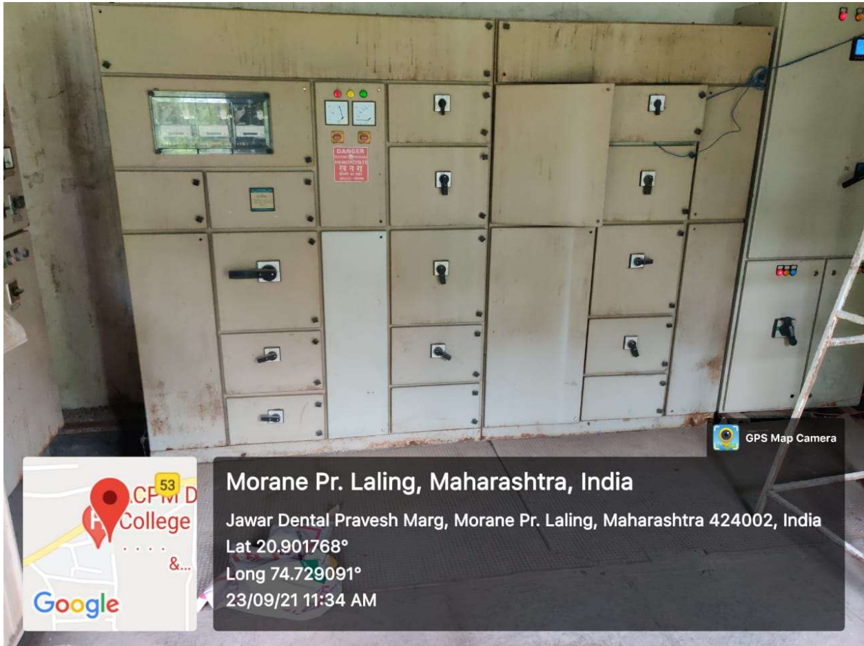
Electric power supply panel