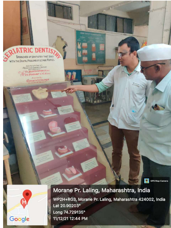
Geriatric Patient education and motivation