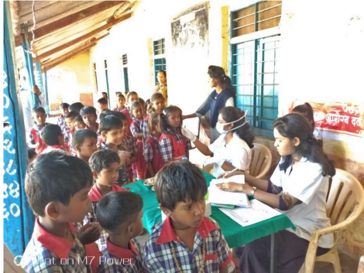
Generating awareness and improving oral health in school children