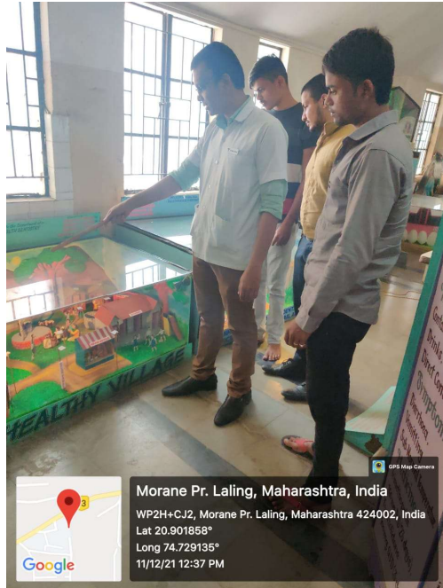
Patient education and demonstration using models