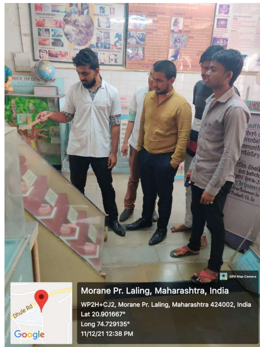
Patient education and demonstration using models