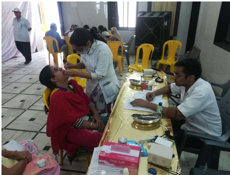
Provide dental services on a large scale, with the cooperation of professional organizations and other NGO's .