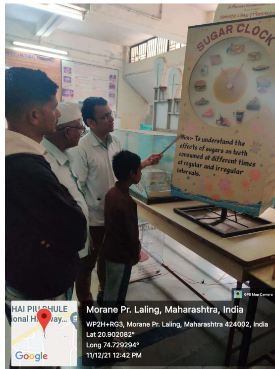
Oral health education to the visitors