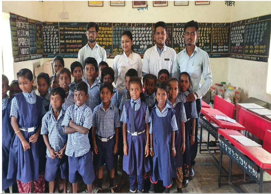
Dental Awareness in School Community