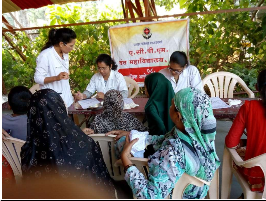
Dental Awareness in Local Community